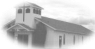
Holy Trinity Church Mission