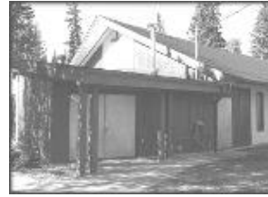
ST. JOSEPH'S PARISH Vanderhoof, BC

5th Sunday in Ordinary Time Year A February 8th, 2026