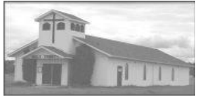
HOLY TRINITY CHURCH MISSION Saik'uz First Nation, BC

"O come, let us worship God and bow low before the God who made us, for he is the Lord our God."