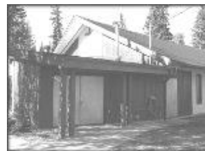
ST. JOSEPH'S PARISH Vanderhoof, BC