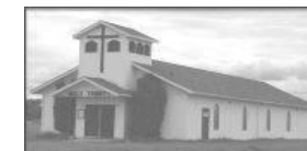
HOLY TRINITY CHURCH MISSION Saik'uz First Nation, BC

"After the Lord was baptized, the heavens were opened, and the Spirit descended upon him like a dove, and the voice of the Father thundered: This is my beloved Son, with whom I am well pleased."