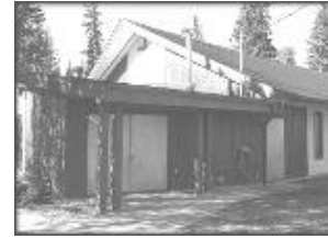
ST. JOSEPH'S PARISH Vanderhoof, BC